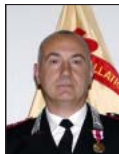
Spolaore Meritorius service medal