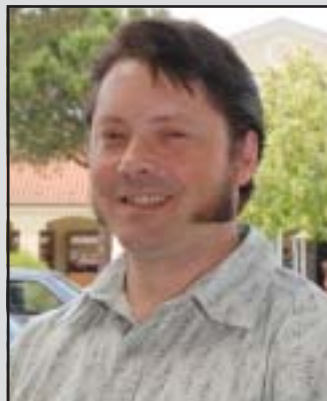
Kevin Boucher Tax Relief Office

“The 60-70s. Both of us like The Beatles; they delight different generations. One of their songs: Hello, Goodbye.”