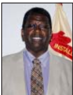
Frater 40 years of service