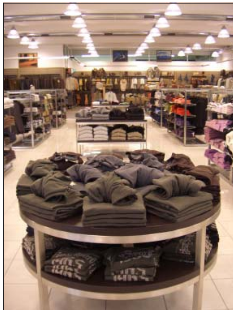
Area VFG outlets accept credit cards and are open on Saturdays.

Vicenza's ITR also offers outlet shopping trips. Call 634-7094 for details. For more information in English on outlets, shops and factory stores all over Italy, visit http://en.zerodelta.net/speciali/outlet-spacci-e-factory-store-in-italia/ .